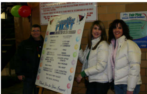
Families First Committee Members