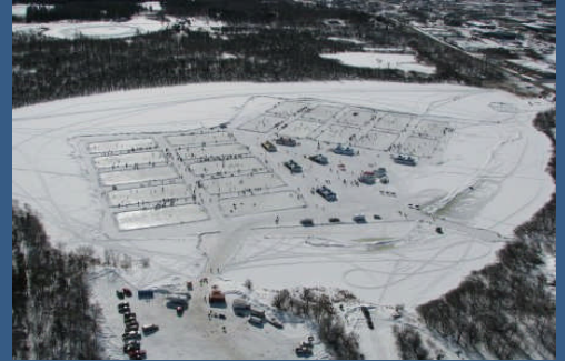
Circle Lake, North Bay Ontario