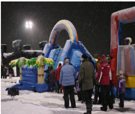
Winter Inflatable Land