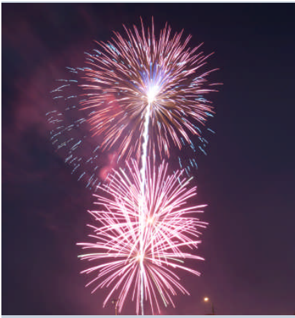
Fireworks Finale, Families First New Years Eve Celebration Dec. 31st, 2009