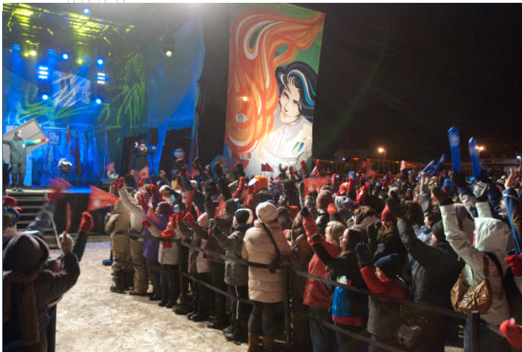
Olympic Torch Relay Community Celebration Dec. 30 th 2009